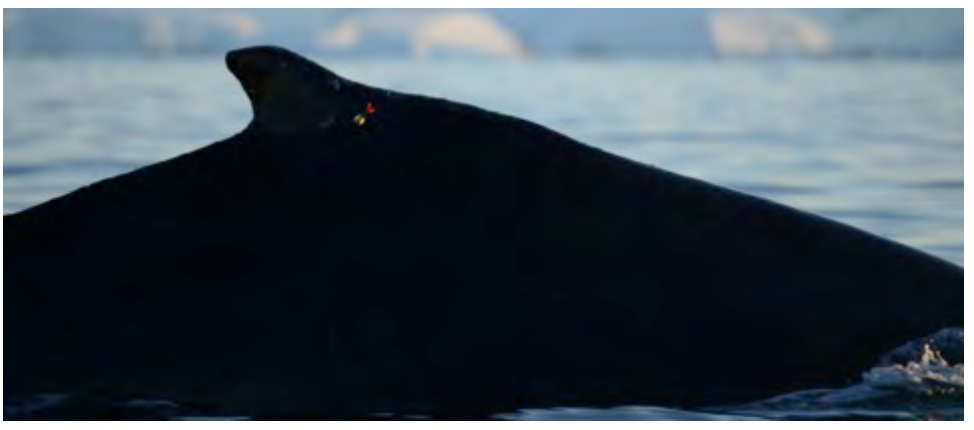
Figure 8. humpback whale flukes (top) showing unique marking patterns and humpback whale dorsal fin (bottom) with a biopsy dart present in flight to collect a small skin and blubber sample.

C-045: Microbial Biogeochemistry Component (H. Ducklow, Lamont Doherty Earth Observatory; PI).