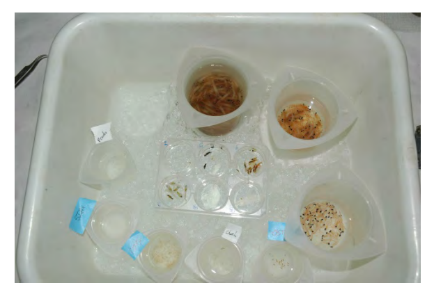
Figure 7. Clockwise from top left: Graduate student Danielle Hall removes predators from the sample. Undergraduate students Anjali Bhatnagar and Andrew Corso sort taxa in the laboratory. A processed sample with the various taxa separated.