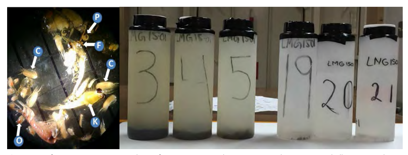
Figure 10. Left: Dissecting micrscope photo of swimmers in a sediment trap sample. K: Antarctic krill; C: copepods; O: ostracod; F: krill fecal pellet; P: polychaete worm. Right: trap collection cups showing higher (cups 3-5, Feb 15 - May 01) and lower fluxes (cups 19-21, Jan 10-31).

The highlight of our week was successful recovery and deployment of the long term (1992-present) sediment trap ( Fig. 9 ) at LTER Grid reference ~580.130, in the northern midshelf region of our study area, in 350 meters bottom depth. The trap is moored at 170 meters in the water column, in an attempt to sample the flux of particles sinking out of the surface layer while minimizing the entry into the trap, and subsequent death of zooplankton "swimmers" – actively swimming animals that enter the trap and are poisoned by the formaldehyde preservative, rather than being part of the constellation of passively sinking particles. Often, this wish goes unfulfilled, as the trap seems to operate more like a water hole in the desert, or a dumpster attracting rats, than simply a sinking particle interceptor ( Fig 10, left ). The particle flux varies by