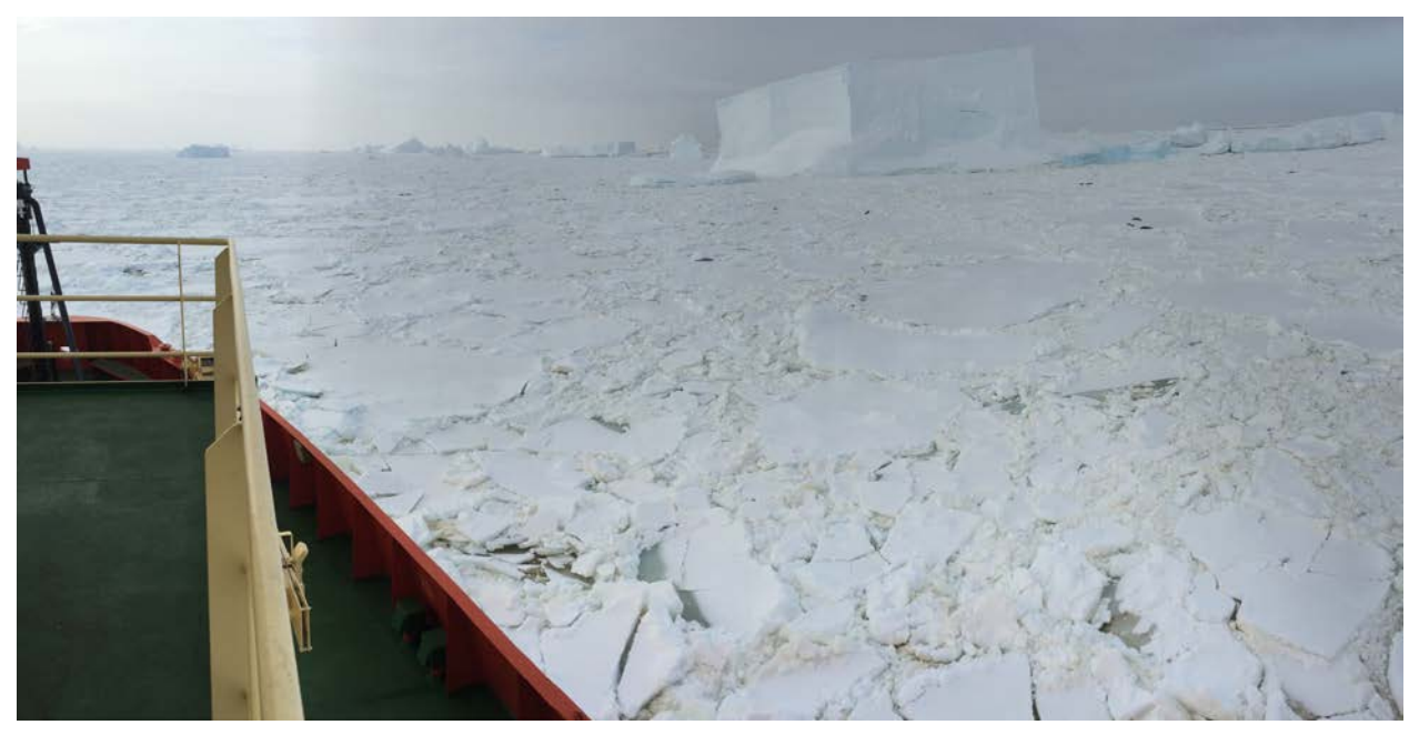
Figure 1. 10/10 sea ice cover and big bergs at station 300.060, Feb. 5, 2016

Operations over the past ten days continued to be affected by the shifting, sometimes heavy sea ice cover. The week started with successful recovery and deployment of the long-term sediment trap near Hugo Island, in the northern, midshelf region of our study area, about 60 miles from Palmer Station (see the 045 report below). We deployed a physical oceanography mooring in loose 8/10 ice at station 300.040, but two planned deployments at stations 300.060 and 300.100 had to be scrubbed due to heavy ice cover and the presence of several large bergs ( Figure 1 ). We completed our third process study comparing areas near Palmer Station with and without whales. Finally, we took on board the birder team from Palmer Station (Bill Fraser, Shawn Farry and Ben Cook) who teamed with our birders to conduct a census of Adelie, Chinstrap and Gentoo populations in the Rosenthal Islands, on the NW side of Anvers Island.