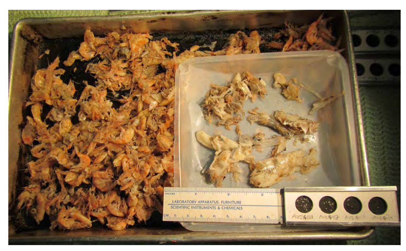
Figure 2. Stomach contents of an Adélie penguin; Semi-fresh Euphausia Superba krill and large fish chunks. Tiny fish ear bones, known as otoliths are collected and put into wells within trays like the one seen in the lower right corner of this photo. These can be used to ID the species of fish penguins are foraging for. Some diet samples contain over 50 otoliths.

Our final week of LTER16 consisted of additional at-sea observations of seabirds near the 300 grid-line and Palmer Deep area, in addition to an off-ship excursion to colonies of breeding Adélie penguins in proximity to Prospect Point and the Fish Islands. Our fieldwork at the Fish Islands included diet sampling ( Fig. 2 ) adult Adélie penguins and conducting censuses of 8 individual islands. In the final few days of the cruise we plan to visit the Rosenthal Islands for similar field work with Chinstrap and Gentoo Penguins.